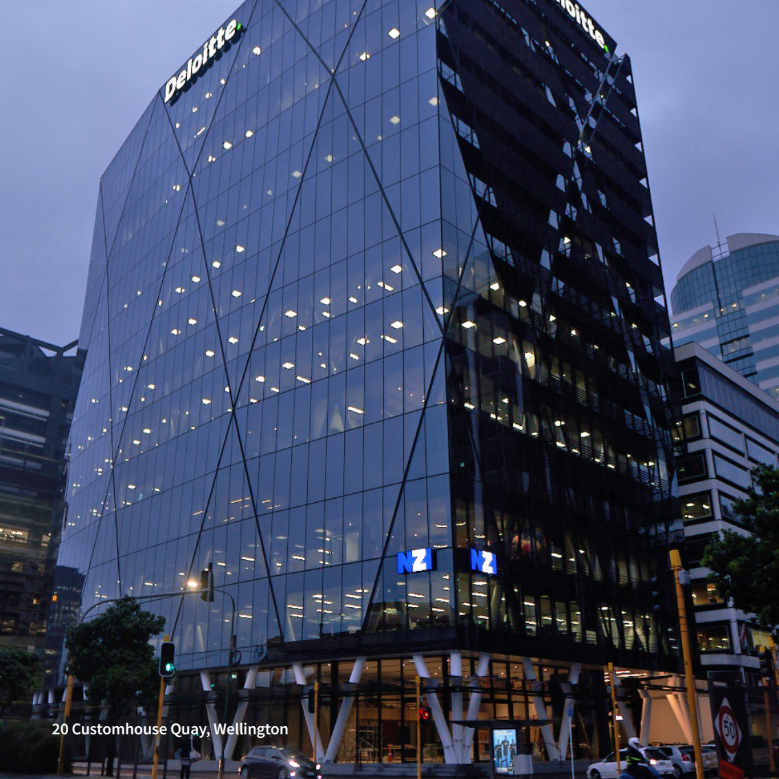
20 Customhouse Quay, Wellington