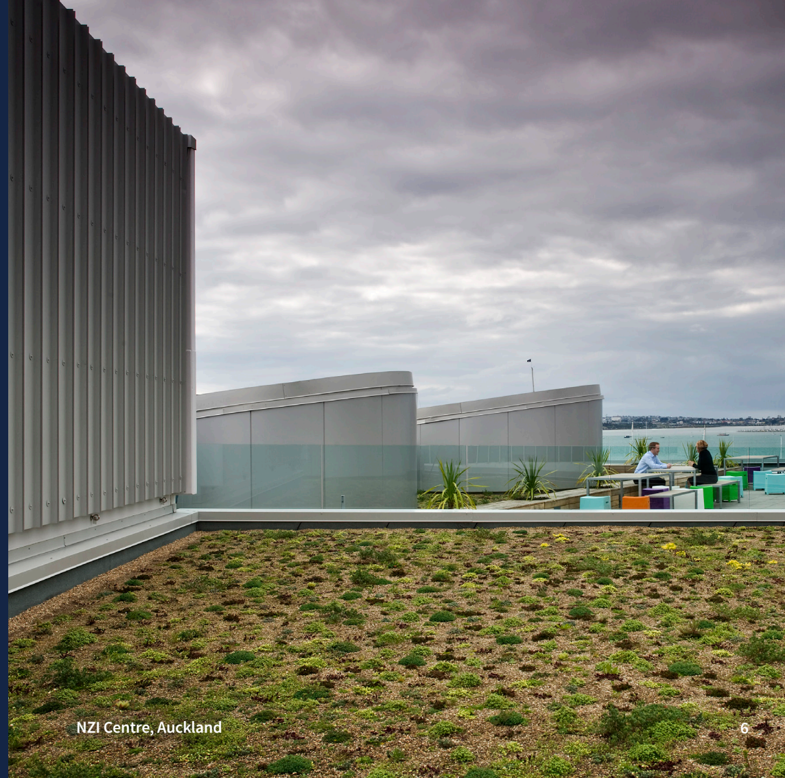
NZI Centre, Auckland