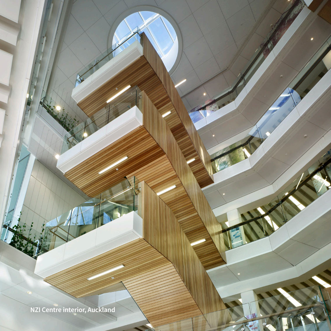
NZI Centre interior, Auckland