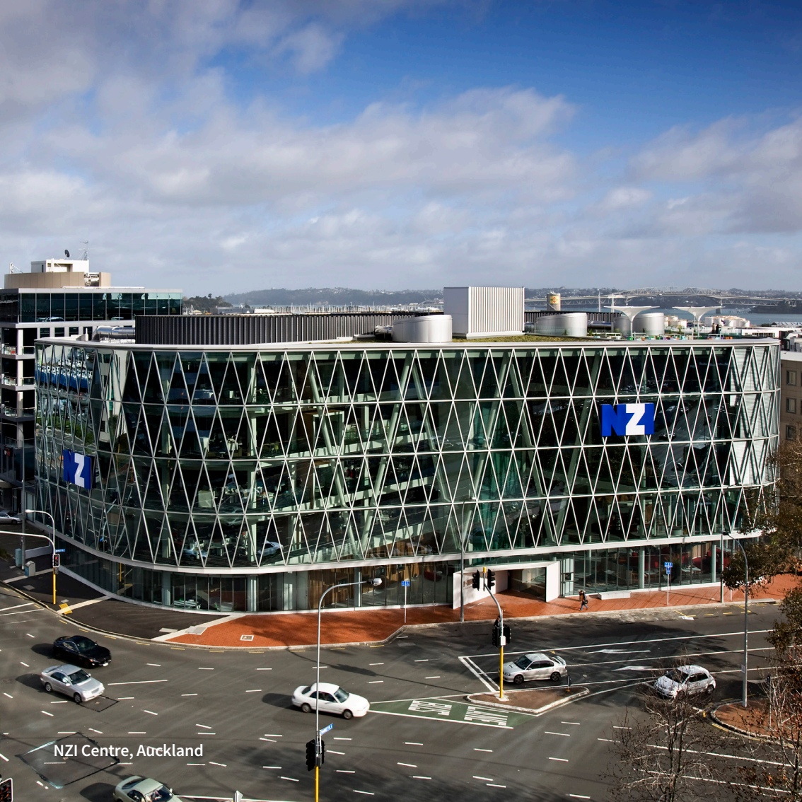
NZI Centre, Auckland